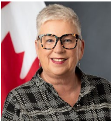
The Honorable Bernadette Jordan Consul General of Canada in New England

Bernadette Jordan (BA [Political Science], St. Francis Xavier University, 1984) was raised on the South Shore of Nova Scotia in a small fishing community. Her love of her community and desire to see it grow and thrive started at a young age when she became a community volunteer while in junior high school.